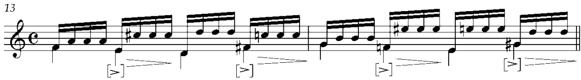
Figure 5. Matteo Carcassi, Etude No. 7 , mm. 13-14.