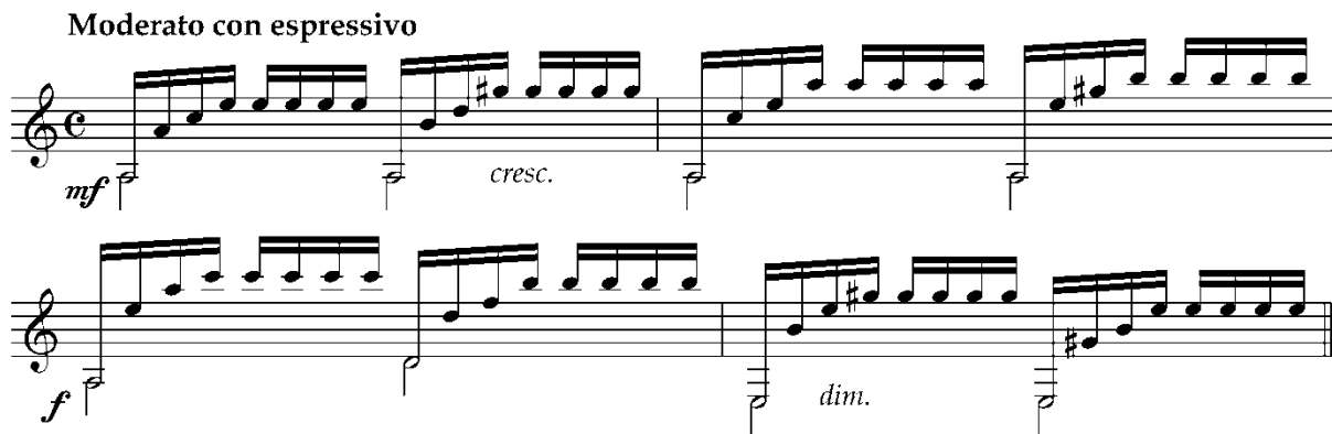
Figure 3. Matteo Carcassi, Etude No. 2 , mm. 1-4.

Carcassi also employs dynamic markings to shape broader melodic effects. Melodic ascents and descents and other changes of register, for example, are routinely provided appropriate crescendo and diminuendo markings. Etude No. 2 provides an example [Figure 3]: