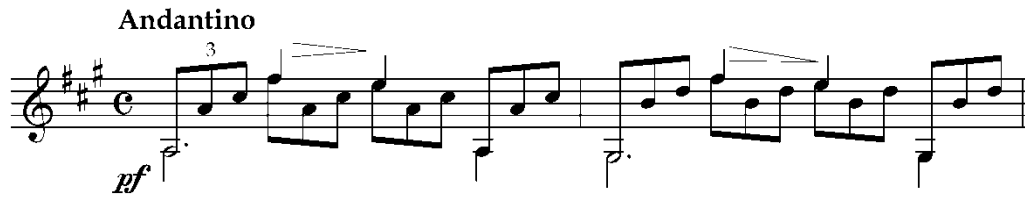
Figure 2. Matteo Carcassi, Etude No. 3 , mm. 1-2.

Carcassi also employs dynamic markings to shape broader melodic effects. Melodic ascents and descents and other changes of register, for example, are routinely provided appropriate crescendo and diminuendo markings. Etude No. 2 provides an example [Figure 3]: