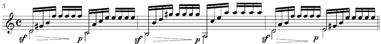
Figure 4. Matteo Carcassi, Etude No. 2 , mm. 5-7.

The rhythmic effect of such figures can often result in an interesting syncopated effect, as in Etude No. 7 [Figure 5]: